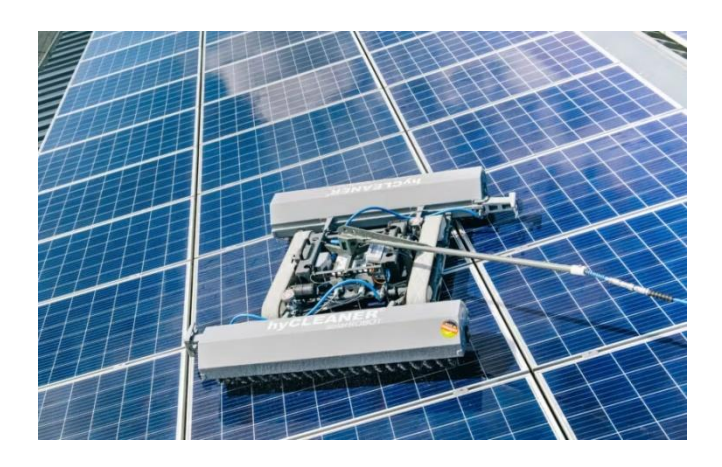
Fig. 1: Dry Cleaning Robot