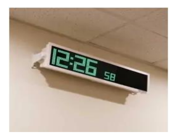
Figure 2: Modern Wireless LED Message Board: For Text Messaging and Digital Time Display