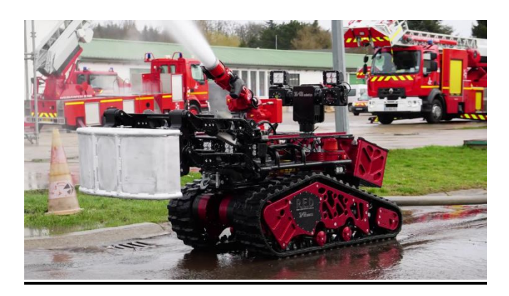
Figure 1: Fire-Fighting Robot

[23–25], LIDAR, and infrared sensors to help robots navigate through intricate and dynamic environments. With the help of light-dependent resistors (LDRs), a line-following robot [26, 27] can track and navigate through a maze of lines, avoid obstacles, and put out any fires [4].