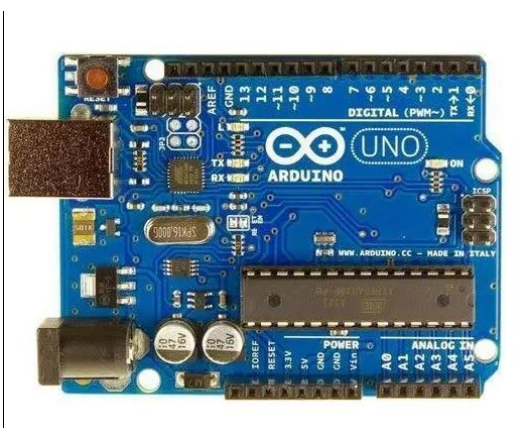
Fig. 2. Arduino Uno

Arduino Board UNO Model is an ATmega328P-based microcontroller board (datasheet). It has a 16 MHz ceramic resonator (CSTCE16M0V53-R0), 6 analog inputs, 14 digital input/output pins (of which 6 can be used as PWM outputs), a USB port, a power jack, an ICSP header, and a reset button. It comes with everything required to support the microcontroller; to use it, just plug in a USB cable, an AC-to-DC adapter, or a battery to power it. With your Uno, you can experiment without too much concern that you'll make a mistake. In the worst event, you can start over by replacing the chip for a few dollars. The Italian word "uno" (which translates to "one") was chosen to signify the 1.0 release of the Arduino Software (IDE). The Uno board with the Arduino Software (IDE) version 1.0 served as the foundation for later generations of Arduino. The Uno board, the first in a line of USB Arduino boards, serves as the platform's benchmark. See the Arduino index of boards for a comprehensive list of all active, retired, or out-of-date boards.