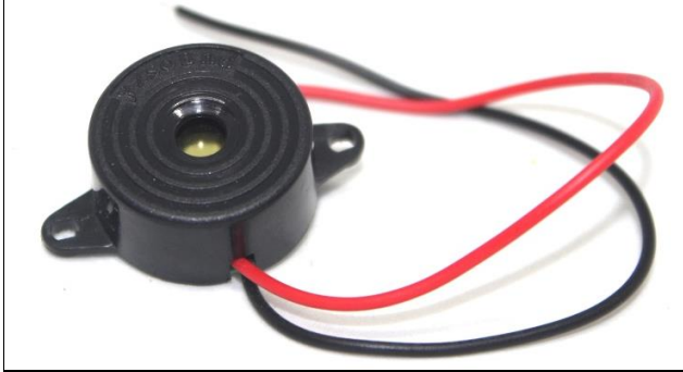
Fig. 3. Buzzer

A beeper or buzzer, for example, may be electromechanical, piezoelectric, or mechanical. The signal is converted from audio to sound as its primary function. It is often powered by DC voltage and used in timers, alarm clocks, printers, computers, and other electronic devices. It can produce a variety of sounds, including alarms, music, bells, and sirens, depending on the varied designs.